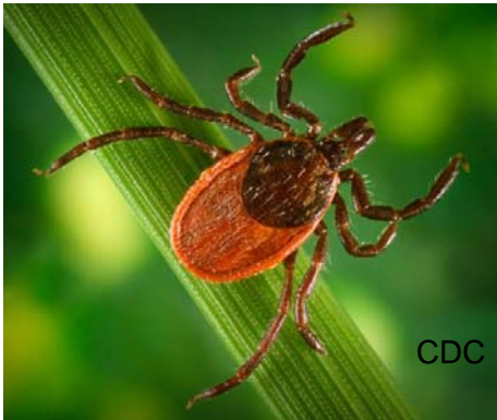
An adult female blacklegged tick waiting on a blade of grass for host.

Ticks are closely related to spiders. They are typically small when unfed, (1 to 5 mm in length), and all active stages feed on blood. They cannot fly and they move quite slowly. Ticks usually come in contact with people or animals by positioning themselves on tall grass and bushes. They may take several hours to find a suitable place on the host to attach to feed. Most tick bites are painless. The majority of bites will not result in disease because most ticks are not infected with the agent of Lyme disease.